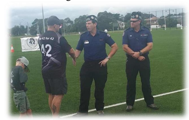
The '42' stands for the 41 veterans we lost in Afghanistan, with the 42nd representing all defence personnel that have died in training or have taken their own lives after serving Australia in Afghanistan" – Never