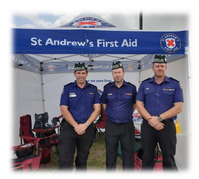
Australia Day saw a team of three attend the Cricket Big Bash 42 for 42.